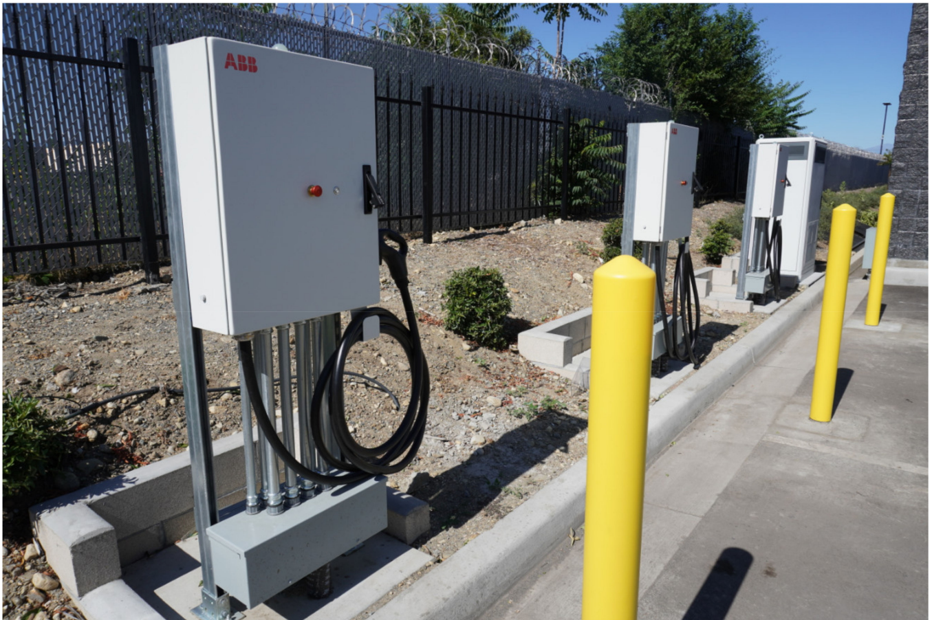
Figure 5. An example of outdoor charging infrastructure.