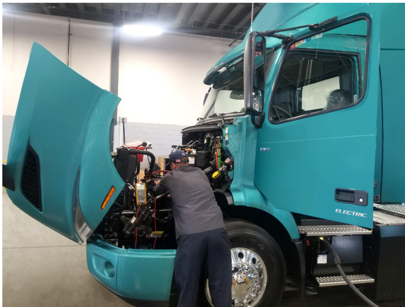
Figure 7. A specially certified technician at a Volvo Trucks dealership performs maintenance on a Volvo VNR Electric.