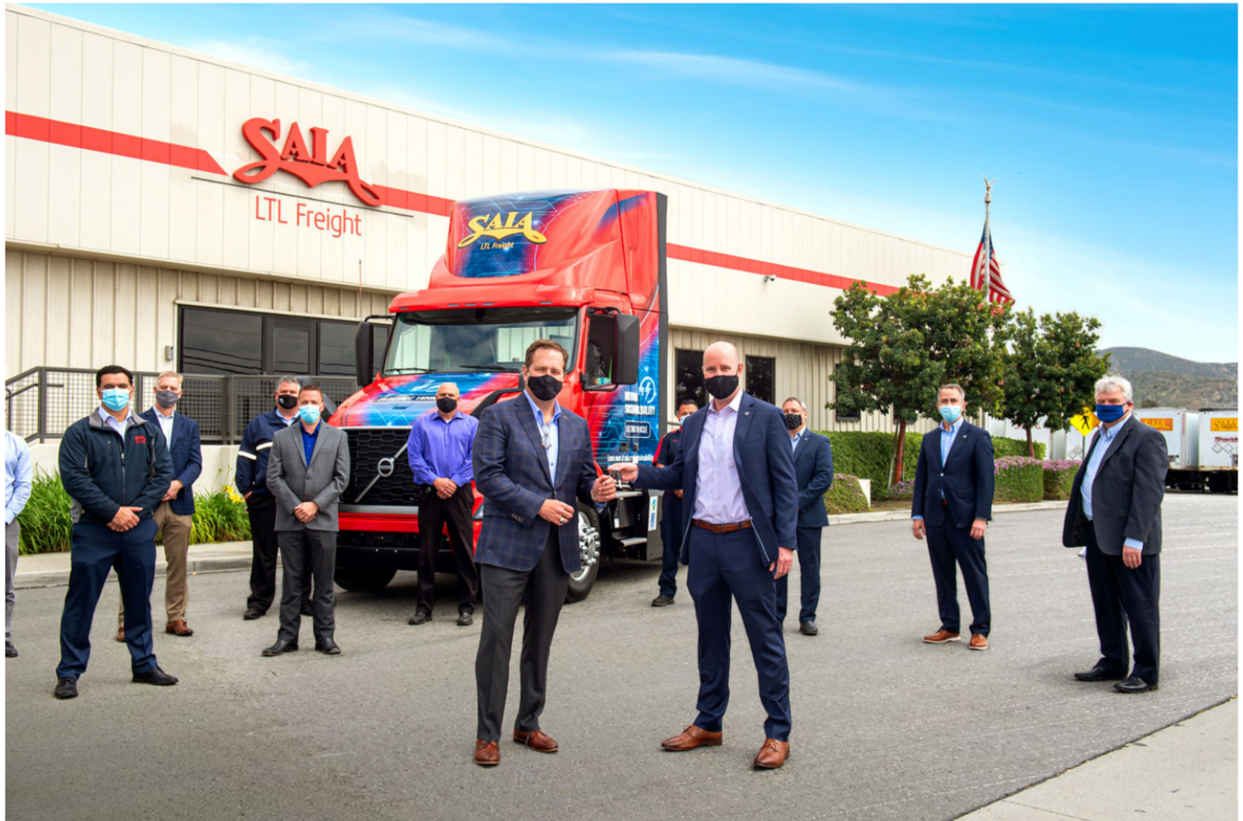
Figure 3. Saia executives, drivers, technicians, and Volvo Trucks North America (VTNA) representatives during Saia's first Volvo VNR Electric delivery, where VTNA representatives explained details of the truck and its operation to the SAIA team.

permits. The key to overcoming potential friction or delays will require sensitivity and clear communication among these stakeholder groups.