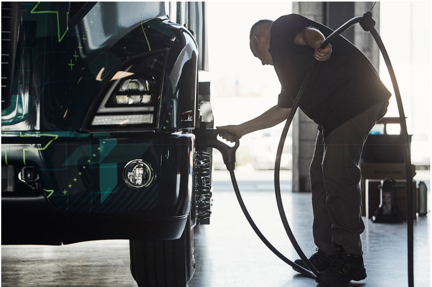
Figure 4. A Volvo VNR Electric is being plugged in to charge up.

The utility company can also provide guidance on taking advantage of demand-response pricing to help commercial fleets save money by charging during off-peak periods. Early engagement with all these stakeholders can help clarify costs and timeline ramifications for the overall project.