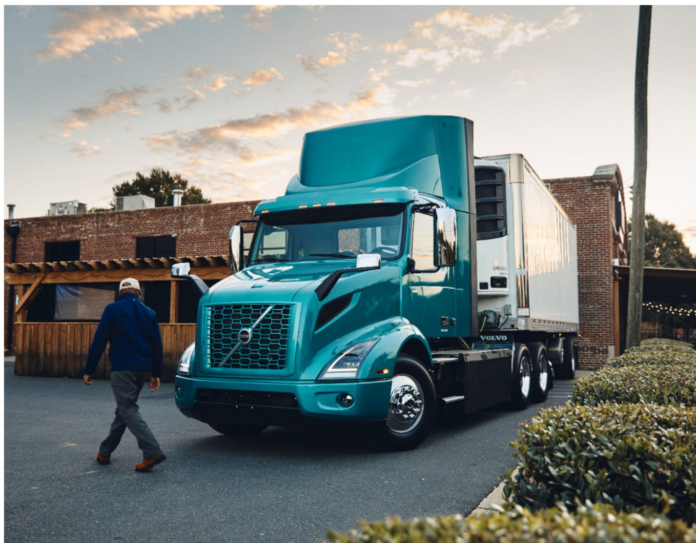
Figure 2. The Volvo VNR Electric model is currently being used in day-to-day, revenue-generating customer operations.

As noted previously, truck OEMs have always worked closely with customers to inform their product development and build brand loyalty. However, this principle will become exponentially more important with the widespread introduction of electric trucks. Not all trucks are created equal. Manufacturing specs such as gross vehicle weight rating, gross axle weight rating, transmissions, engine, tires, electrical and air systems, and cab configuration can vary greatly to meet business needs based on geography, duty cycles, and payloads. With the advent of electric trucks, truck manufacturers will need to understand commercial fleet needs and business models even more comprehensively as limited onboard energy and availability of charging affect the range, charging frequency, operational duty cycle, and route optimization for maximizing uptime. Electric powertrains present a whole new “ball of wax” that could lead to new business models for both truck manufacturers and fleets.